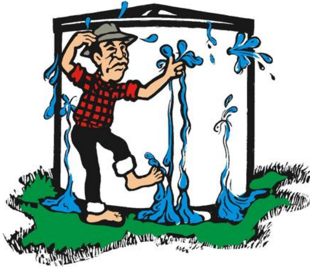
“THE SECURITY GUY”, 2018, UNKNOWN ARTIST