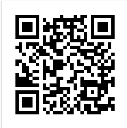
Figure 1: HackerTrain homepage: https://hackertrain.org